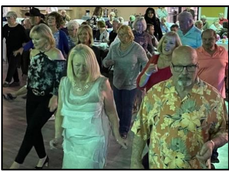
Moving with the Beat