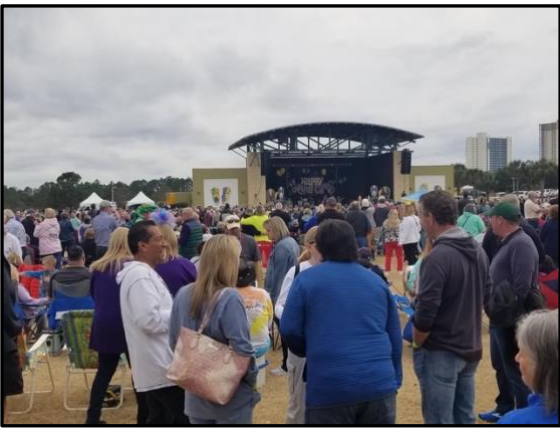
Mardi Gras "Foules "

Combined with the excitement of an authentic Mardi Gras celebration and live music by the Swingin' Medallions and Guess Who, the Women's Civic Club's beer concessions was very busy. Thanks to the many volunteers who made this fundraiser a great success. "Laissez les Bons Temps Rouler"